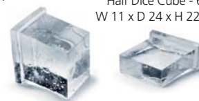
Dice Cube - 10 g W 22 x D 24 x H 22 mm

Half Dice Cube - 6 g W 11 x D 24 x H 22 mm