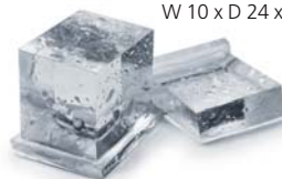
Large Cube - 17 g W 29 x D 24 x H 29 mm

Half Large Cube - 6 g W 10 x D 24 x H 29 mm