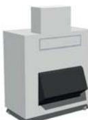
MV606+UBH1100 (sold separately)