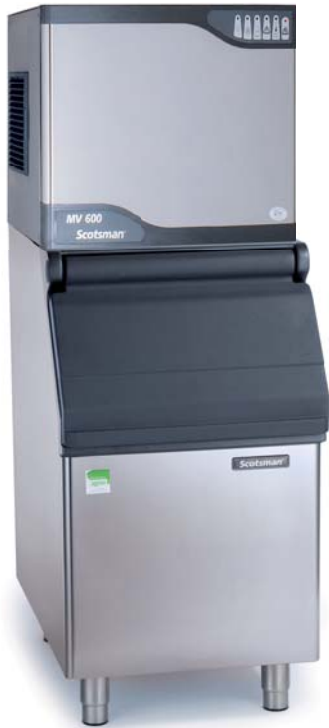
MV 606 with SB393 (sold separately)