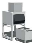
MV606+SIS700 (sold separately)

This product qualifies for the following listings: