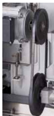
Pulleys & belt system allows to modify ice thickness