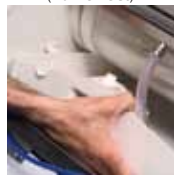
Easy to remove water sump