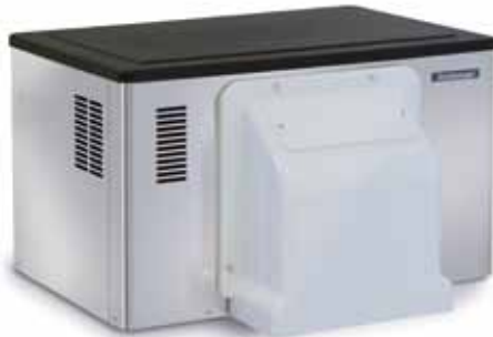
ABS Ice Chute Cover: sold separately.