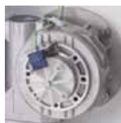
Gear box protection (hall effect)