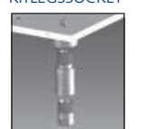
Available as optional KITLEGSSOCKET