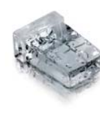
Half Dice Cube - 6 g 11 x 23 x 26 mm