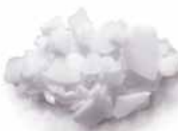
Residual water content 2%

Ice scales are the coldest form of ice. Formed at -6° to -12°Celsius, they are very dry, containing less than 2% residual water. Scales look like fragments of glass, have an irregular shape and a thickness that can be adjusted at 1 or 2 mm.