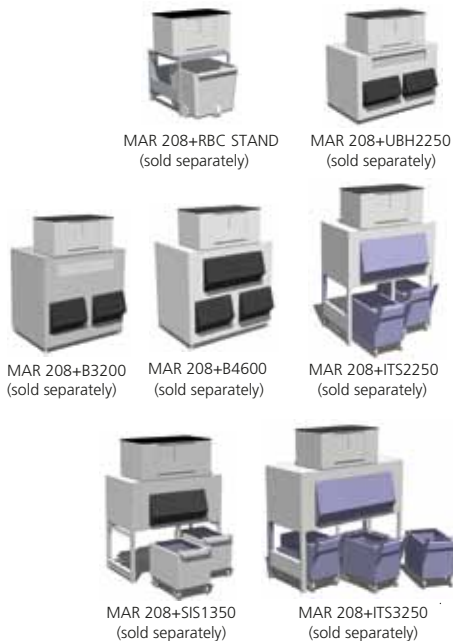
MAR 208+RBC STAND (sold separately)