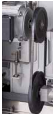
Pulleys & belt system allows to modify ice thickness