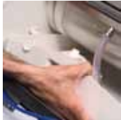
Easy to remove water sump