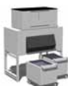
MAR 208+SIS1350 (sold separately)