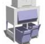
MAR 208+ITS2250 (sold separately)