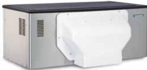
ABS Ice Chute Cover: sold separately.