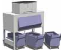
MAR 208+ITS3250 (sold separately)