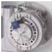
Gear box protection (hall effect)