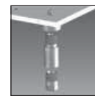
Available as optional KITLGSEXT000