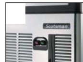
Front ON-OFF Switch Storage bin antibacterial pouch & holder