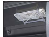
Patented anti-Scale system